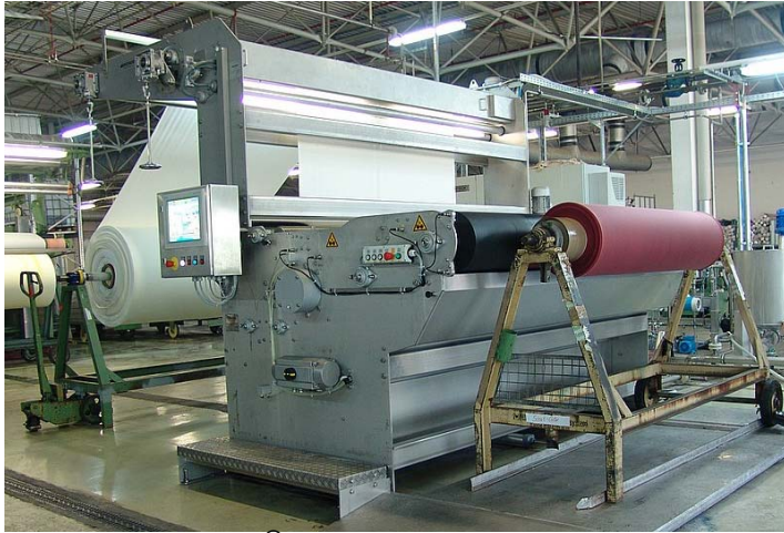
SCOUT COLOR® Dye Padder in operation

The dyeing on the padder is followed by turning of the fabric batches for several hours on hydraulically or electrically driven turning stations. Finally the dyed fabric is washed in an open-width continuous washing range. The total water consumption of the whole finishing process can be kept as low as 20 liters per kg of fabric.