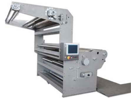
Dye padder for knitted fabrics

CPB on knits has been successfully operated in Europe for more than 20 years. Most larger knit finishing companies in Europe are relying solely on this process for the dyeing of their cellulosic fabrics (cotton, viscose, modal, linen and their blends with elastane) because of its cost and operational advantages. The CPB method allows a low-cost and high-quality dyeing while avoiding some of the problems experienced in rope dyeing. Especially for viscose and blends with elastane the advantages of going open width are very strong.