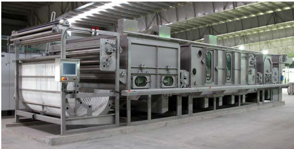
SCOUT® Continuous Washing Range

The dyeing on the padder is followed by turning of the fabric batches for several hours on hydraulically or electrically driven turning stations. Finally the dyed fabric is washed in an open-width continuous washing range. The total water consumption of the whole finishing process can be kept as low as 20 liters per kg of fabric.